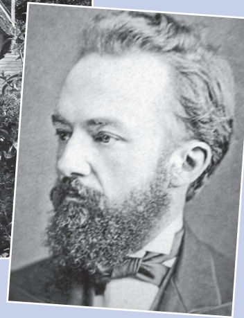
Right: Thomas Hardy with a full beard in his mid thirties.