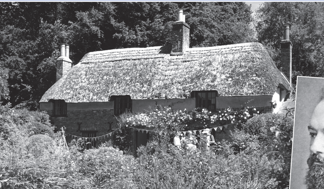
Left: Thomas Hardy's birthplace.